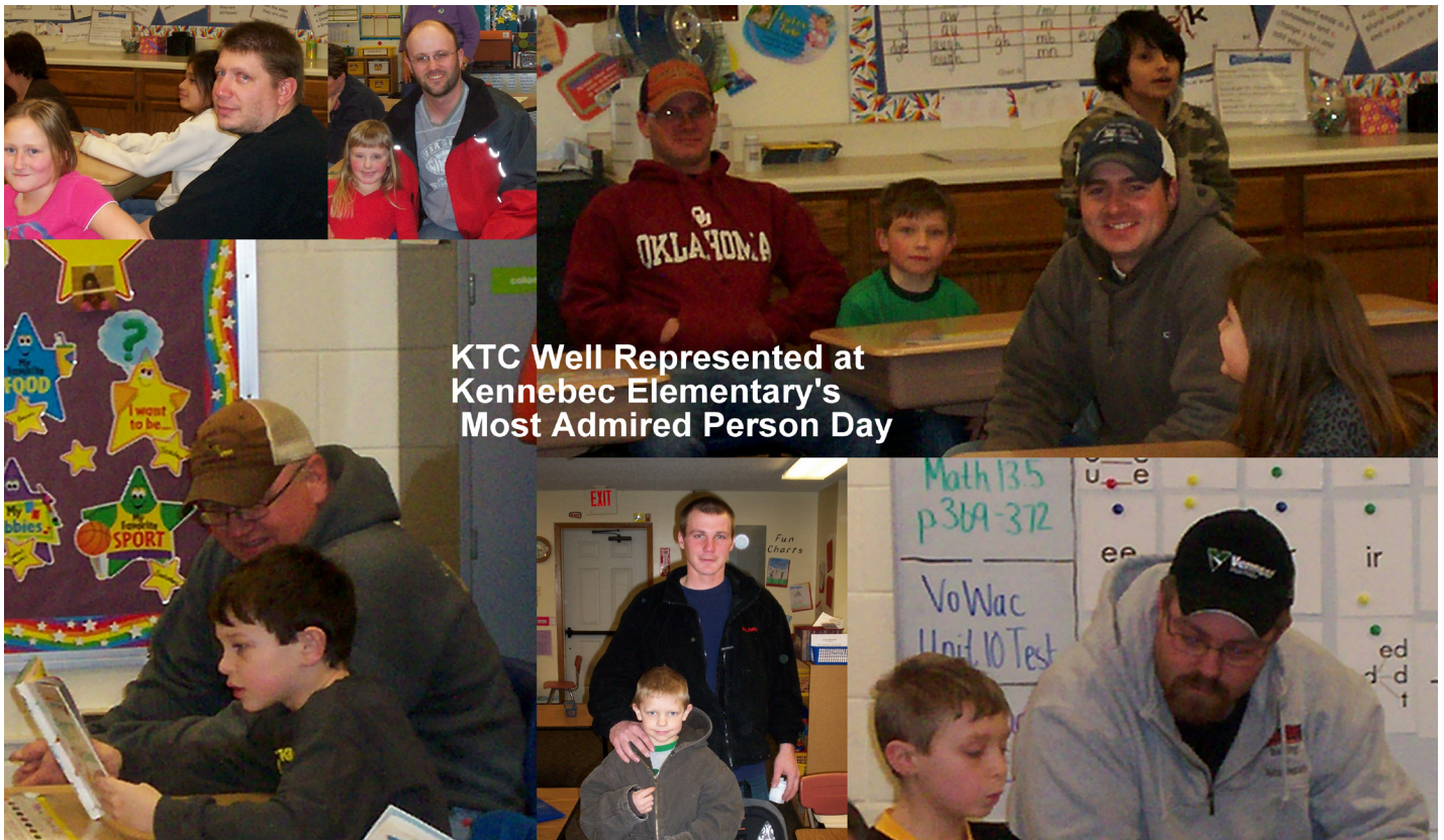
KTC Well Represented at Kennebec Elementary's Most Admired Person Day